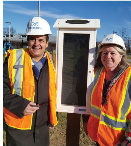
Message Boards in the Community Applewood Acres Homeowners Association welcomes the new installation of the community message board in Westacres Park.