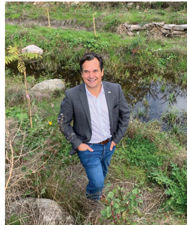
Serson Creek Rehabilitation of Serson Creek.