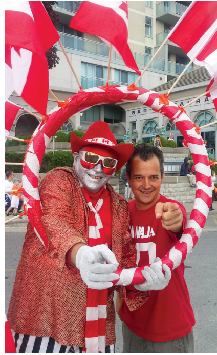
Canada Day Wishing you and your family a Happy Canada Day.