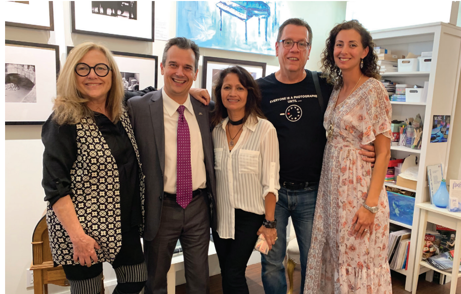
Arts on the Credit Pleased to join the Arts on the Credit.