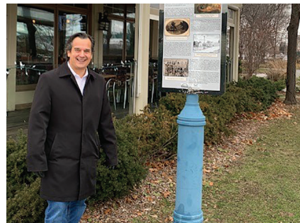
J.J. Plaus Park Pleased to endorse historical signage.